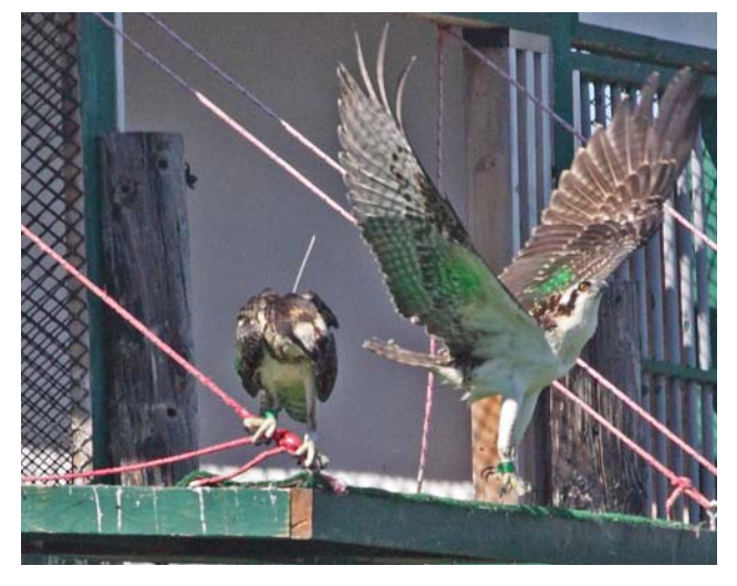
These juvenile osprey, fitted with transmitters and identifiable with green paint, practice flapping their wings before leaving the "nest."

At this time, of the 2 instrumented birds, the female remains near the release site while the male has already begun his journey south and is located in Kansas. Over the next few years, it is thought the birds will