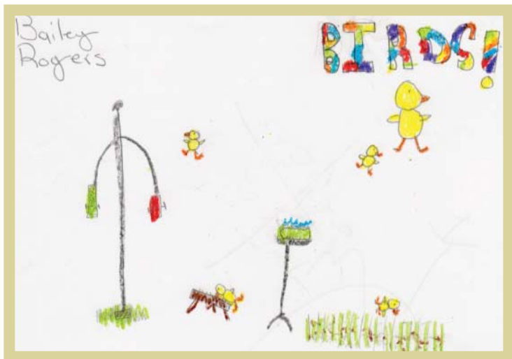
Looking out the classroom window; picture by Bailey Rogers, 4th grade.