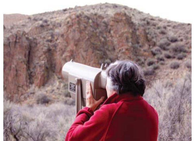
A viewing scope at the site will enable visitors to view bighorn sheep up close; photo by Dale Toweill, IDFG.