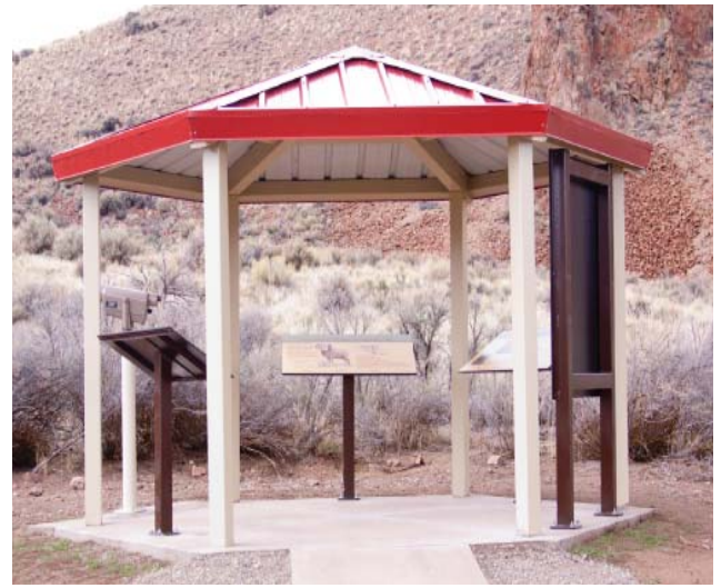
Buffalo Jump Bighorn Sheep viewing station near Challis; photo by Dale Toweill, IDFG.

Watchable Wildlife is sometimes misunderstood as being an activity for people who don't hunt and fish. This could not be further from the truth. Many sportsmen and women enjoy watching birds and other wildlife in their own backyards or while out taking a hike. The bighorn sheep viewing station project was led by sportsman's groups. Watchable Wildlife is a program every Idahoan who loves wildlife can support!