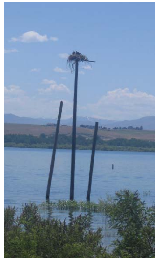
Osprey nest

This spring the osprey returned on March 28th, laid the first egg on April 22nd and we speculate the first egg hatched around May 28th. Currently, there are three young ospreys in the nest. The young are growing very fast and will begin to take their first flights near the end of July.