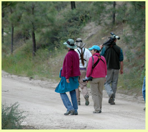
Field trip to Daggett Creek.