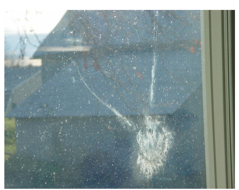
Evidence of a mourning dove hitting a window.