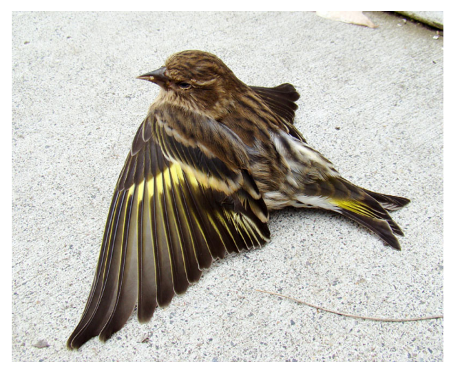
This pine siskin flew into a window and is photographed recovering from the impact. It returned to the bird feeder a couple of minutes later.

Birds don't always die when they strike windows. Sometimes they fly away, apparently unharmed; other times they fall to the ground, stunned. If you find a dazed bird, take it inside where predators can't reach it and place it in a dark container such as a shoe box. The darkness will keep the bird quiet while it revives, which should occur within a few minutes, unless it is seriously injured. Release the bird as soon as it appears awake and alert.