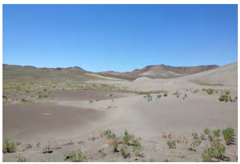
Bruneau Dunes tiger beetle habitat