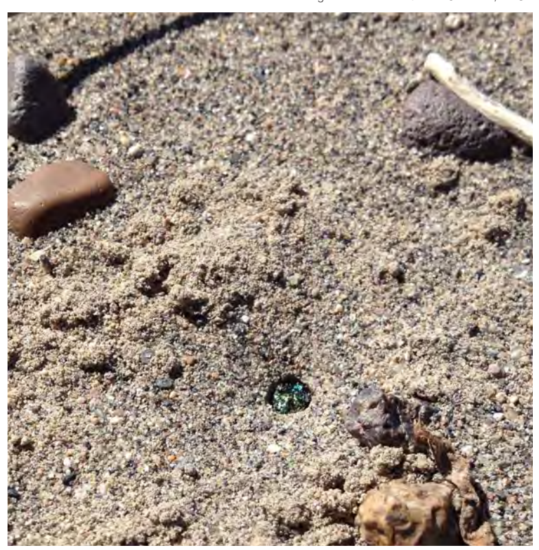
arval burrow of the Bruneau Dunes tiger beetle