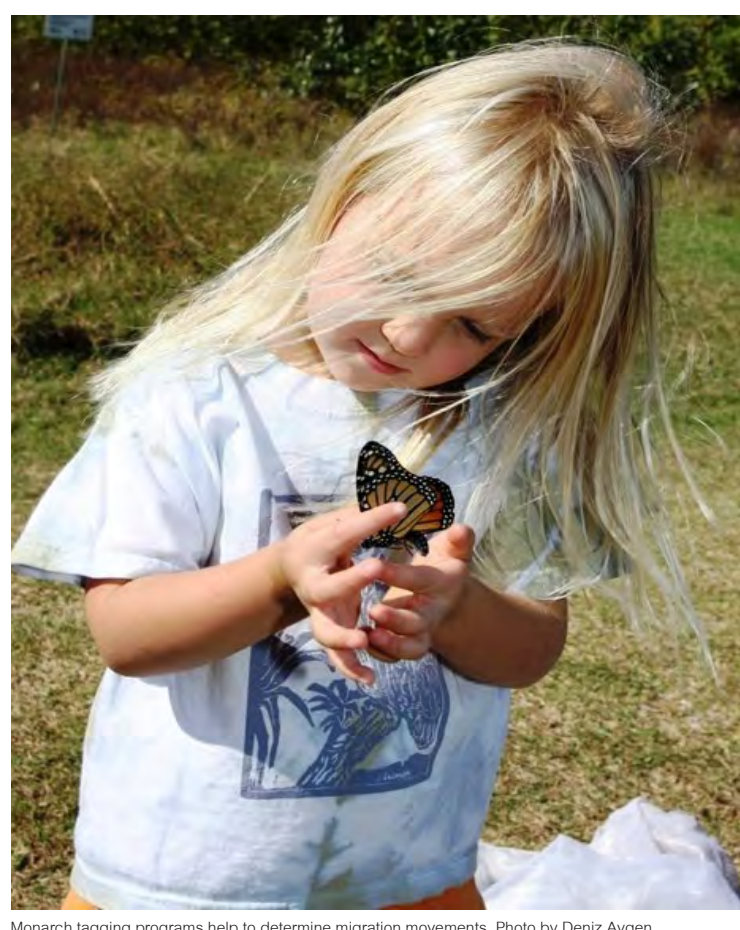
Monarch tagging programs help to determine migration movements.

Conservation and restoration of milkweeds can help!