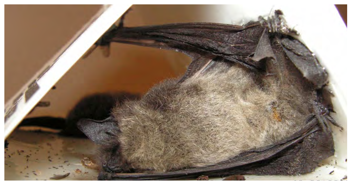
Bat stuck in a glue trap

Awareness of the glue trap issue is a first step toward minimizing their unintentional impact on wildlife. Use your consumer power to choose more humane pest control options, such as live traps integrated with preventive measures. If glue traps are used, place them responsibly in secured indoor areas and check traps frequently for target and non-target captures. Taking personal responsibility in using glue traps and other pest control methods can make a real difference in the lives of wild creatures we treasure.