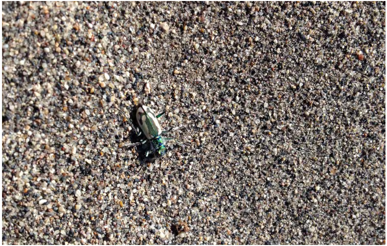
Bruneau Dunes tiger beetle