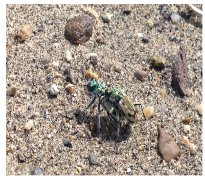
Bruneau Dunes tiger mating behavior

Many of the traditional methods for combating invasive weeds don't work as effectively in sandy systems because every time the sand is opened back up and allowed to move the invasive weed seed bed is re-exposed and new plants emerge. In essence the mechanism that created the dunes is slowly destroying it and we are left to scramble to find solutions to save these unique Idaho land features. Idaho Fish and Game Diversity Program Staff have been monitoring Bruneau Dunes Tiger Beetles for almost ten years and have seen a steady decline in usable habitat and beetle populations in and around Bruneau Dunes. We haven't lost hope that we can halt the spread of cheat grass and other non-natives at Bruneau and every day new research provides us with new techniques that will allow us to preserve not just the dunes but the species that depend on them for years into the future. If you have not visited any of Idaho's dunes you are missing out on an amazing experience. The spring is often the best time of year to visit the dunes as it is cooler and the wildflowers and migratory bird activity is booming. Campground facilities, hiking & equestrian trails, and the visitors center/observatory are just many amenities that will allow you to better enjoy Idaho's dunes and wildlife species.