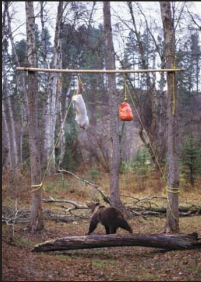
Suspending food between trees, 10-12 feet high, can help safeguard your camp.