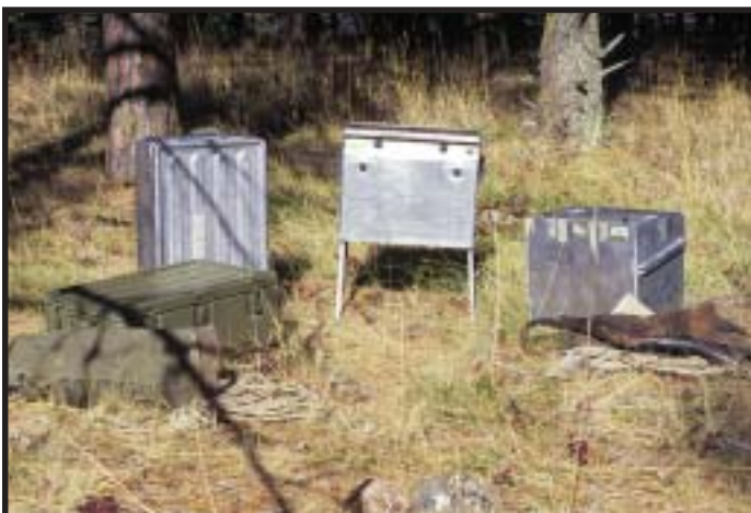
Bear resistant containers and horse packing equipment are effective tools to prevent bear and other wildlife problems.