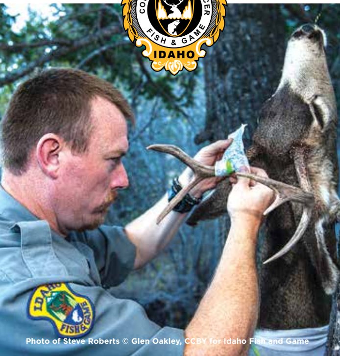
Photo of Steve Roberts © Glen Oakley, CCBY for Idaho Fish and Game

Photo © Glen Oakley, CCBY for Idaho Fish and Game