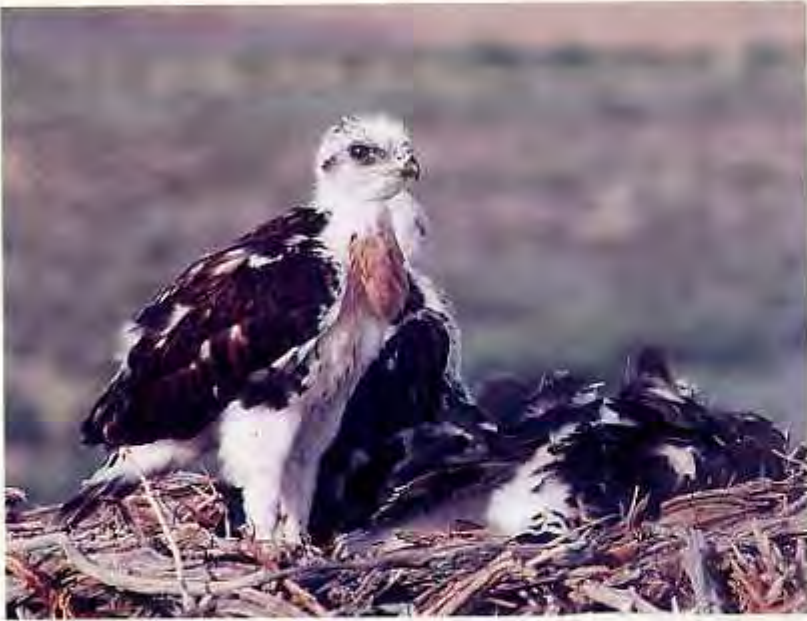
The ferruginous hawk (above), typically nests on cliffs or rocky points. This field of cheatgrass (below) shows the almost continuous fuel chain created by this exotic plant. The inset shows a cheatgrass head.

is eventually replaced by medusahead and other non-native annuals, causing a downward spiral toward permanent dominance of non-native species and deterioration of the site.